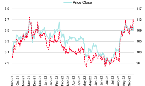
WHA Corp (WHA TB)